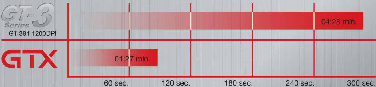
Image size approx. 32cm x 22cm cmym only

Image size approx. 32cm x 22cm cmym+w print